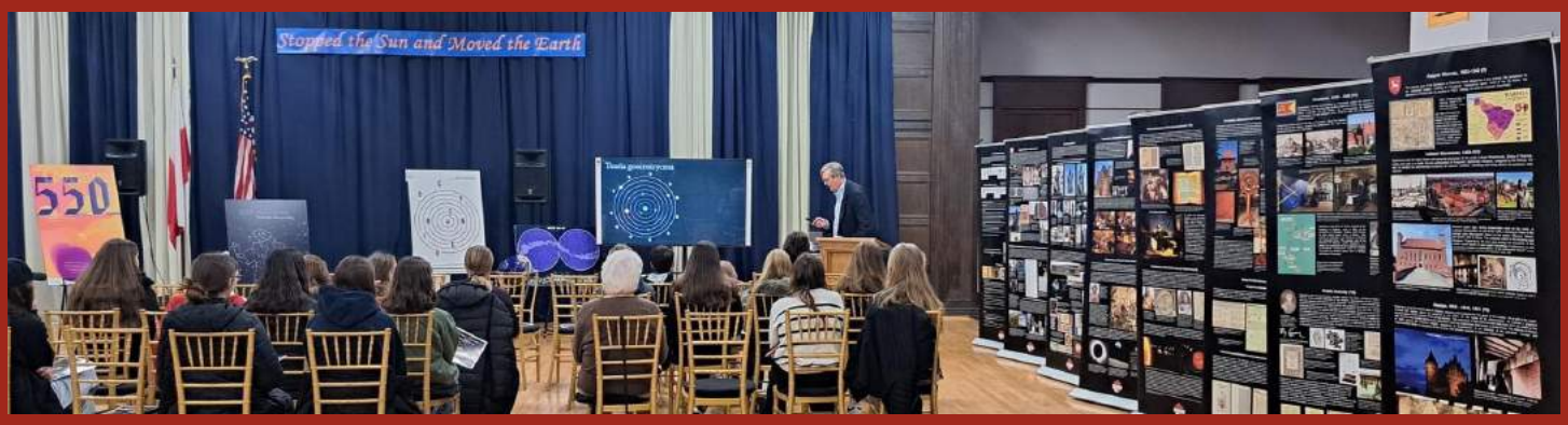
Students from Saint Mary's Preparatory High School in Orchard Lake, and from Wayne State University's Polish language and culture program