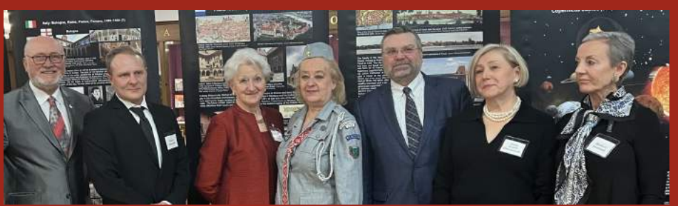
Speakers and organizers at the 550th jubilee exhibit of Nicolaus Copernicus.